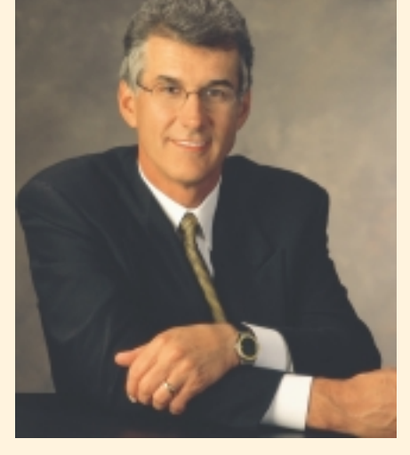
From the Medical Director

American Academy of Facial Plastic & Reconstructive Surgery • American College of Surgeons American Academy of Cosmetic Surgery • International College of Surgeons