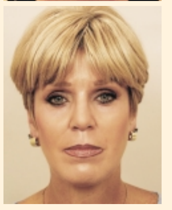
Before and after computer shots