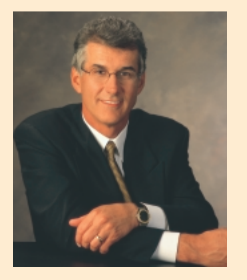
From the Medical Director

American Academy of Facial Plastic & Reconstructive Surgery • American College of Surgeons American Academy of Cosmetic Surgery • International College of Surgeons