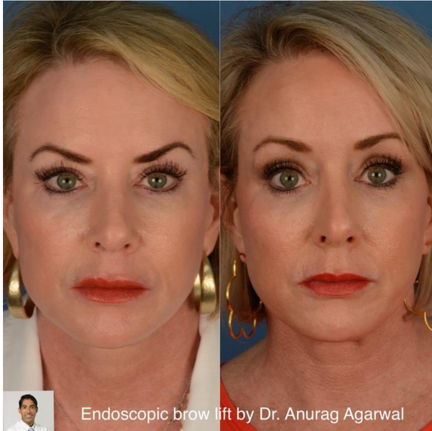
Endoscopic brow lift by Dr. Anurag Agarwal

1175 Creekside Parkway, Suite 100, Naples, FL 34108 | (239) 594 9100 | www.aestheticsurgerycenter.com