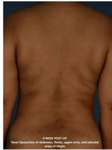
Patient: 40-year-old mother Procedure Type: Liposuction & Renuvion® Amount of Fat Removed: 700cc